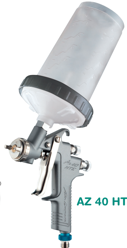
AZ 40 HTE