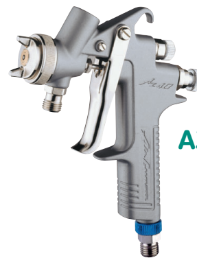
AZ 40 HTE SP